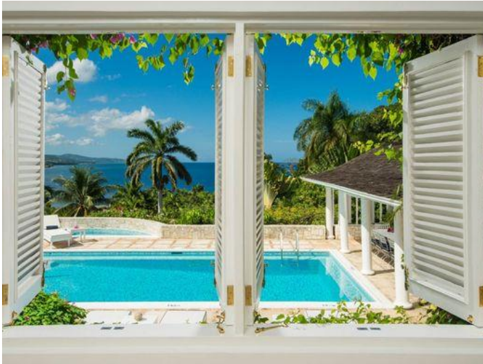
The twenty-seven villas are the benchmark of all-things-glamorous with the six-bedroom Premium Luxury villas going for (US) $26,269 per week, from April 16 to October 31 ($45,719 from November 1 to April 15).