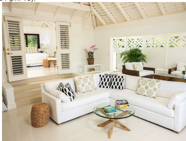
Ralph Lauren put his design touch on thirty-six of the oceanfront rooms.