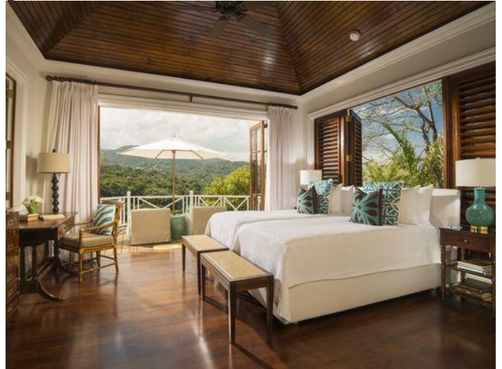
Villa 20 is a stand-out with eight bathrooms, multiple balconies and a large pool.