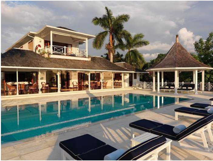
Low-key luxury with a pedigree past, Round Hill Hotel and Villas is the regal retreat for the discerning.